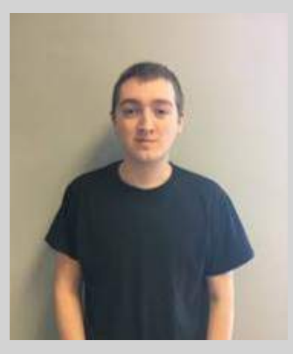
Drew Machining Apprentice Concorde Precision