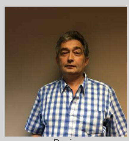
Boris Programmer Concorde Precision