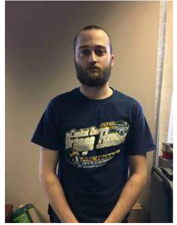
Skylar Electrical Apprentice Reko Automation