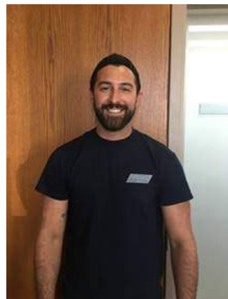
Cody Facility Maintenance Reko Tooling