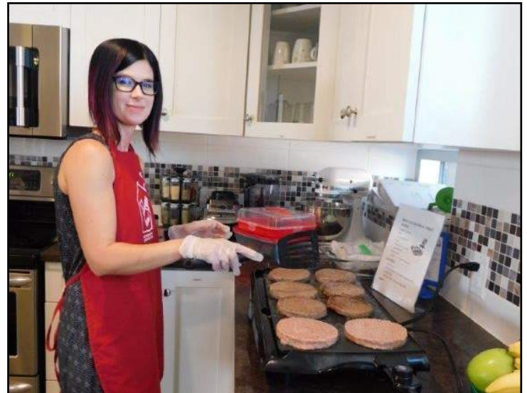
Cooking dinner at the Ronald MacDonald House! Hot dogs, hamburgers, salads and desert!