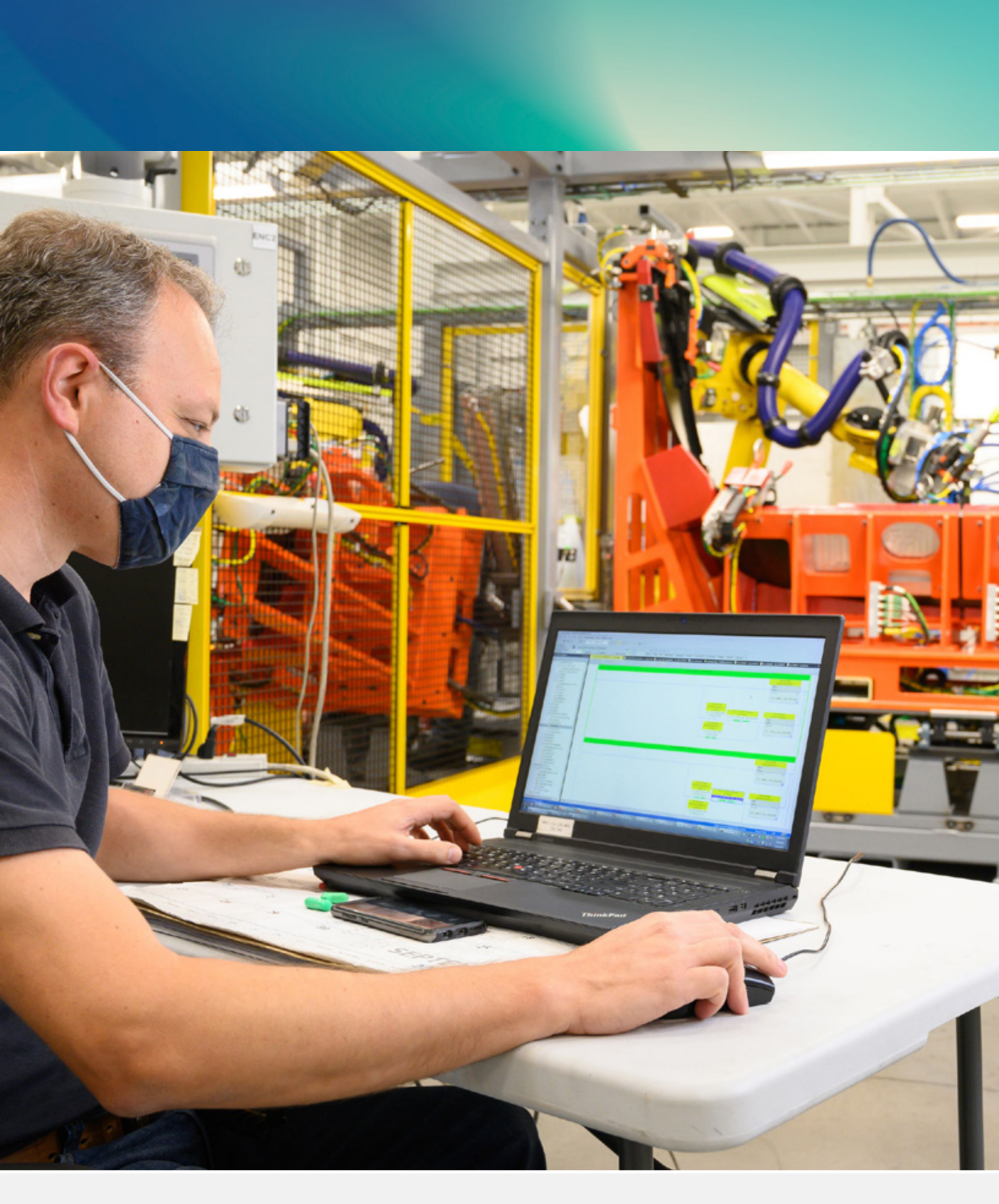
34 Reko International Group Inc. Annual Report 2021