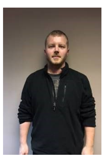
Cory Shipping/Receiving Reko Tooling