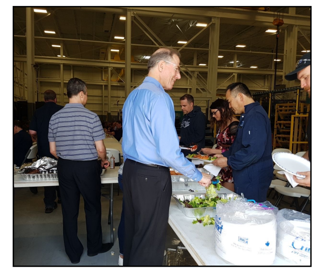
On May 4, the Company hosted its Spring barbeque and Town Hall meeting in the new Automation facility.