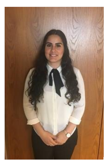
Crystal Business Intern Reko International Group