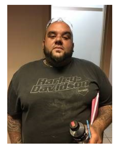
Mitchell Material Handler Concorde